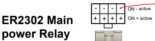
ER2302 Main power Relay

Main power relay ON e.g from door switch